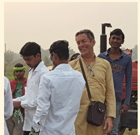
As speaker at agricultural seminar, which took place in Kirpal Sagar in November 2017.