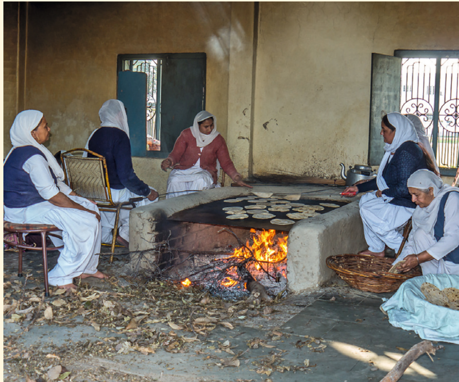
Chapatis in the oven, traditional flat bread made of wheat.