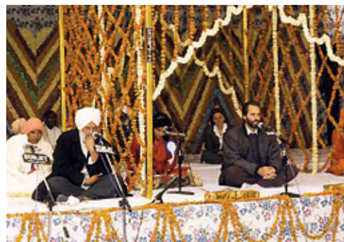
Kirpal Sagar, World Conference 1994