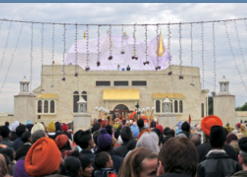
Kirpal Sagar, World Conference 2007