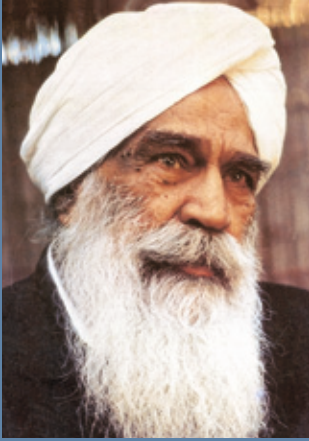
Sant Kirpal Singh 1894 -1974

We are man first; outer labels only came afterwards when we became Hindus, Moslems, Christians, Sikhs, Buddhists, Jains ...