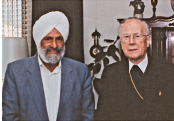
With Archbishop Koenig, Vienna, 1992