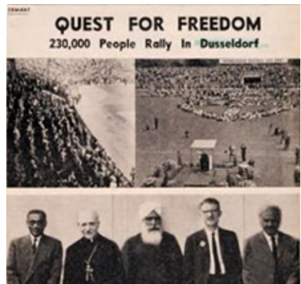
The Voice, page 3, 1963