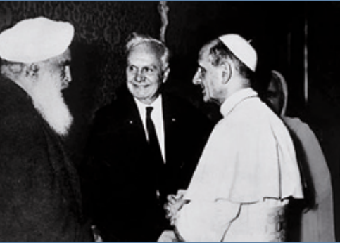
Rome 1963, with Pope Paul IV, Second World Tour