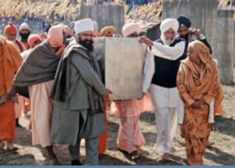
Laying of the foundation stone in the Sarovar, Kirpal Sagar, 1994