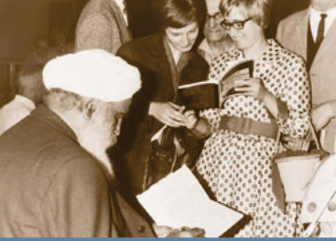
Berlin 1963, book: „Man, know thyself“