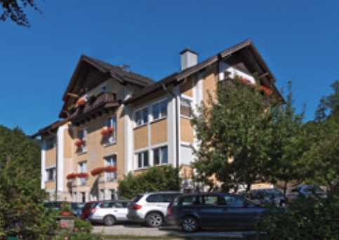
Unity of Man Centre, Austria