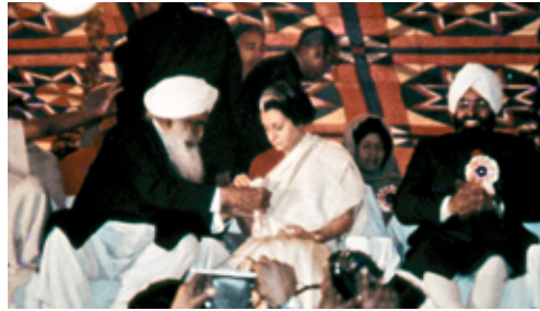
Delhi, World Conference, Indira Gandhi, 1974

In 1994 another major world conference took place in Northern India, in Kirpal Sagar, with delegates from more than 14 countries. The conference closed with a special ceremony: the laying of the foundation stone for the central building of the Sarovar. On its roof four symbols of God's houses were planned and should be seen in future, the sign of the common goal and a model for unity.