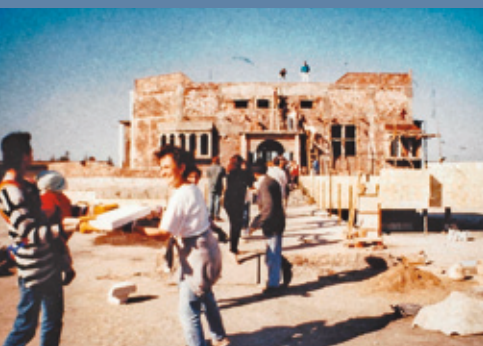
Hand in hand, building material for the symbols