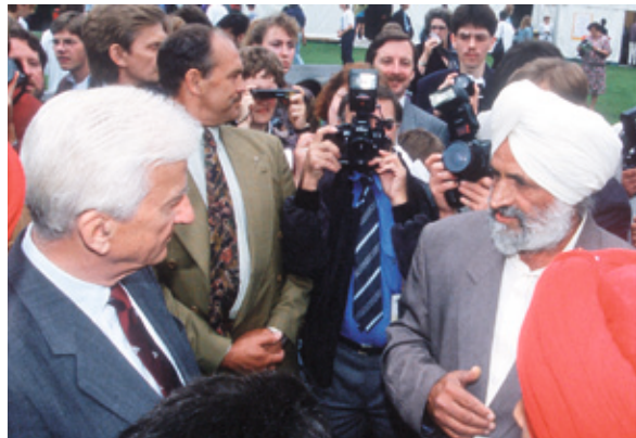
With President von Weizsäcker, Castle Bellevue, Berlin, 1992

“I want to have some heart-to-heart-talk with you, because I think the problems of the world are not political, but they are more spiritual.