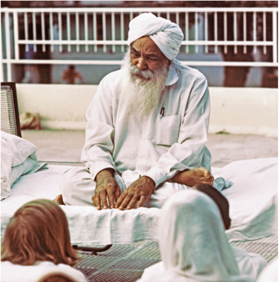
Sant Kirpal Singh, August 17, 1974